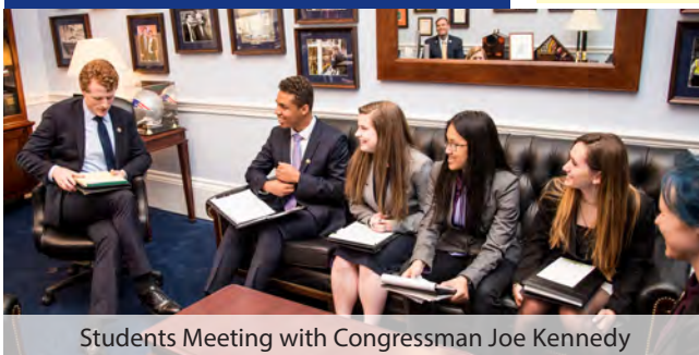
Students Meeting with Congressman Joe Kennedy

Please Note: Above agenda is subject to change