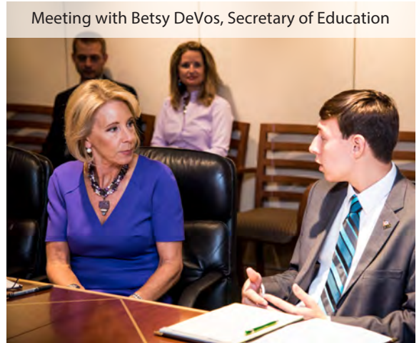
Meeting with Betsy DeVos, Secretary of Education