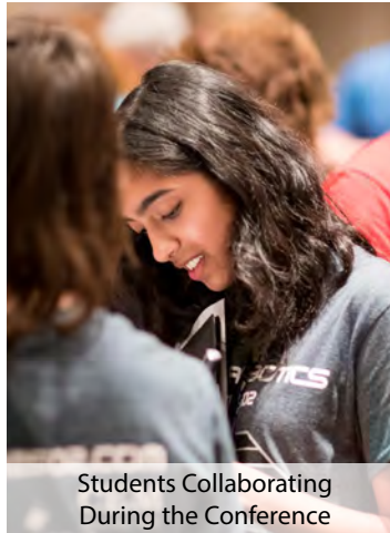
Students Collaborating During the Conference

Students will gain a tremendous amount of self-confidence as they learn, prepare, and lead meetings with Senators and Members of Congress. Students and Mentors alike are typically enlightened with how their government works and usually take a stronger interest in advocacy in the future.